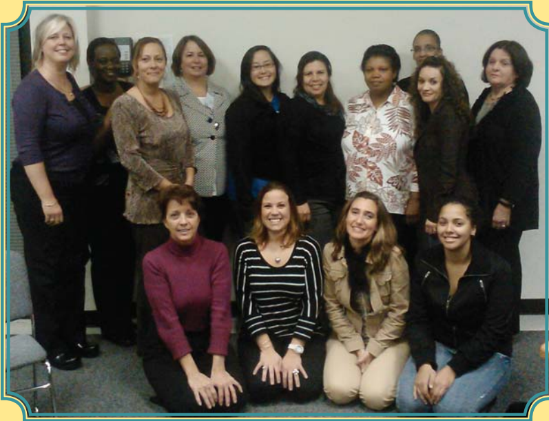
Graduates of the 2011 Fall Session of Family Leadership 101

Thank you so very much for affording me this opportunity, to learn the skills to do this on my OWN!"