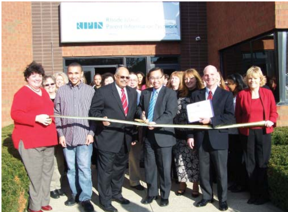
Ribbon Cutting Ceremony of our new Cranston Office