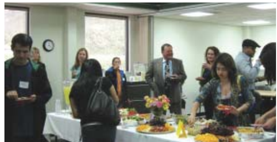
Guests enjoy refreshments in RIPIN's Cranston office conference room.

about all the happenings at RIPIN including summer workshops, parent involvement programs and new sites.