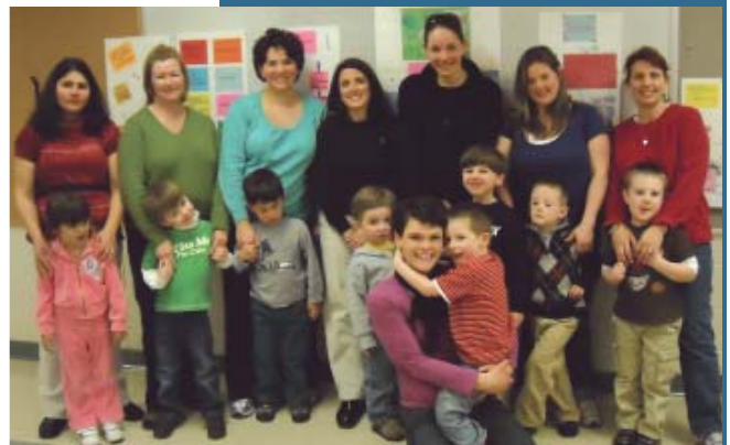
RIPIN educators introduced parents to RIDE's Fun Family Activity cards based on RI's Early Learning Standards at Drum Rock Early Childhood Center in Warwick.

During six sessions, we help parents understand the early learning standards and learn what their preschool child should know and be able to do as they enter kindergarten. As always, RIPIN educators stress that parent involvement is the key to student success!