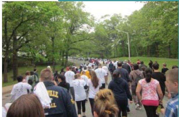
More than 400 community members joined RIPIN at the 1st Annual Walk to STOP Bullying in May.

RIPIN is once again using the successful model of “peers helping peers” with a new Department of Human Services’ (DHS) program, Communities of Care (CoC). By partnering with DHS, Neighborhood Health Plan of RI and United HealthCare, RIPIN’s Communities of Care Peer Navigator team is reaching out to individuals, helping them to better access: community resources; appropriate, timely and proactive medical care; and consistent primary care that can meet their unique needs.