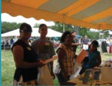
Families visit exhibitors at RIPIN's Family Fun Day.

The year 2011 marks a significant milestone at the Rhode Island Parent Information Network — RIPIN turns 20!